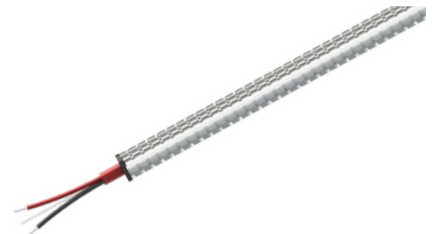
Armor Jacketed Cables