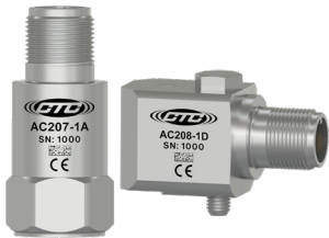
High Temperature IEPE Accelerometer, 2 Pin Connector, 100 mV/g, ±10%