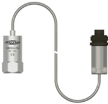
Charge Mode Accelerometer - Must Use with CTC's HA Series Amplifiers