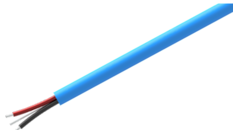
PLTC Jacketed Cable