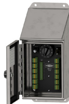
SB SLOPED TOP BOX