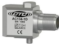
Low Frequency Accelerometer, Side Exit, 2 Pin Connector, 500 mV/g, ±10%