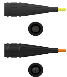
Molded PPS Viton® Boot