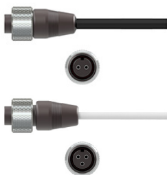
PPS Molded Standard MIL Connector