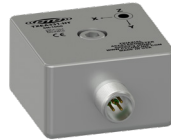
High Temperature Triaxial Accelerometer, Side Exit 4 Pin Mini-MIL Connector, 100 mV/g, ±5%