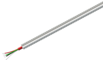
HEAVY DUTY ARMOR JACKETED