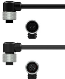
Nylon Molded Right Angle Connector