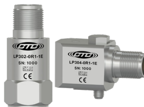
4-20 mA Output Proportional to Vibration in Acceleration