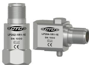
4-20 mA Output Proportional to Vibration in Velocity