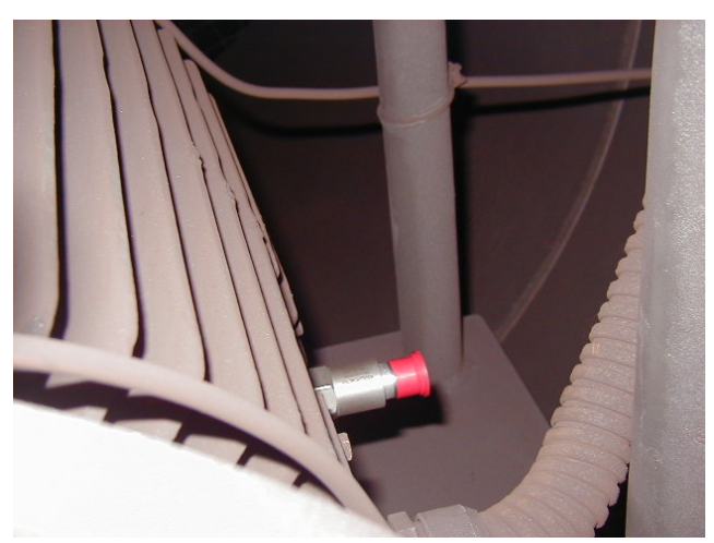
Horizontal Vibration Sensor Mounted on Tunnel Fan Motor