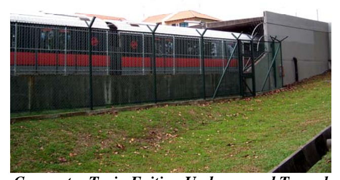
Commuter Train Exiting Underground Tunnel

The worlds developing infrastructure creates many technical challenges for engineering and construction. Quite often names like "Chunnel" (English Channel), "Big Dig" (Boston), and "Nam Wan" (Hong Kong) are feats to marvel at as they provide passages underground, underwater, or straight through a mountain for today's highways and rapid transit systems.