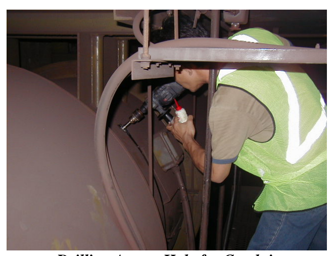
Drilling Access Hole for Conduit

Cable management is also a concern with tunnel fans. Quite often there is a significant amount of air flow and long distances involved from the sensors to the transmitters, or directly to the control room in the case of dual output sensors. Care must be taken and plans put in place to assure that the cables are run in a manner that protects them. Access holes and conduit pipes may be required to protect the cables.