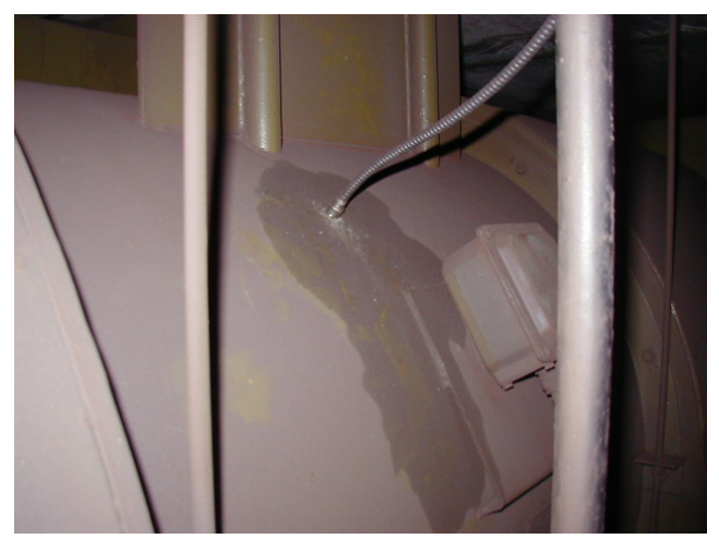
Completed Conduit Connection

Good organization of the wiring will provide robust and understandable wire runs. Each wire should be labeled, and matched to the corresponding sensor.