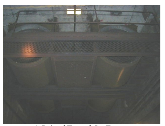
A Pair of Tunnel Jet Fans

Purging of toxic gases with a supply of clean air requires Tunnel Jet Fans. These fans provide longitudinal ventilation of the tunnel and are the primary sources of clean air. Jet fans provide a very high impulse or thrust of clean air into the tunnel and through the tunnel. They are often found in multiple sets mounted on the roof or side wall of the tunnel at selected intervals. The number of fans required is based on tunnel length and design.