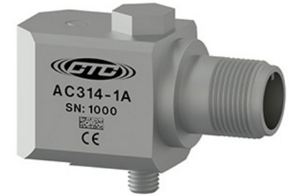
AC314-1A LOW POWER SENSOR