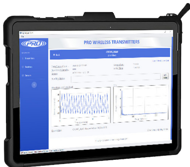
WA100-TAB WIRELESS TABLET

The transmitter is then attached to the sensor and replaces standard connector / cabling. Using Bluetooth technology, data can be sent to the PRO Line WA100-TAB Wireless Tablet within a 150 ft. line-of-sight range. Users can also use the tablet to nickname transmitters, create similar groups according to monitoring application, and configure reading settings for customized data collection.