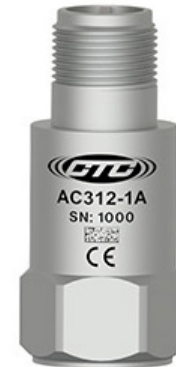
AC312-1A LOW POWER SENSOR