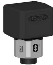
WA102-1A WIRELESS TRANSMITTER

As compared to all-in-one wireless sensors, this two-part design ensures reliable readings as the internal design of the sensors are not altered to accommodate wireless connectivity. As a result, consumers are able to take advantage of our quality, shear mode accelerometer design inside a rugged, stainless steel case for maximum environmental protection.